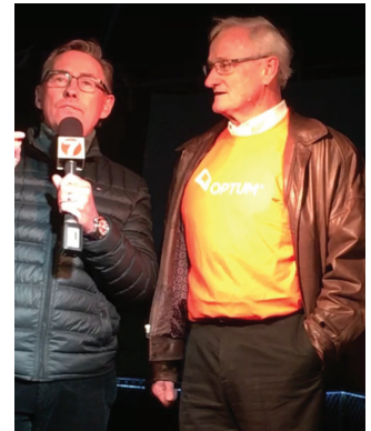
Live broadcast at the Boise Tree Lighting Celebration for 7Cares Idaho Shares