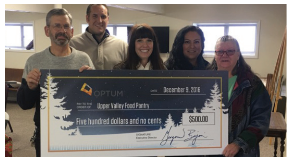
Donation to the Upper Valley Food Pantry in Saint Anthony, ID.