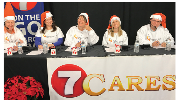
Optum Staff volunteering at the phone bank for 7Cares Idaho Shares