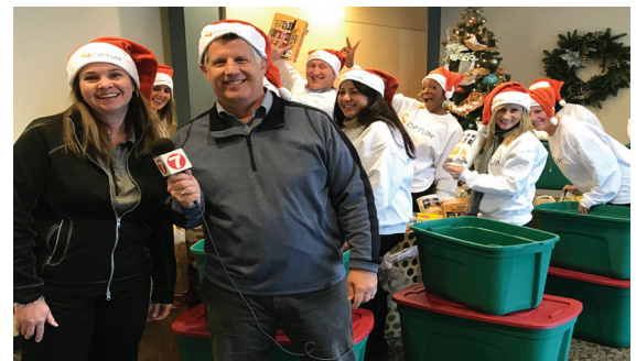
Live Broadcast at the Optum Office for 7Cares Idaho Shares