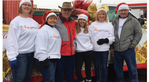
7Cares Idaho Shares day in Twin Falls, Idaho

Optum Idaho employees took an active role in helping make the $22,500 in donations possible. Our efforts were recognized by local media, elected officials and community leaders throughout the state.