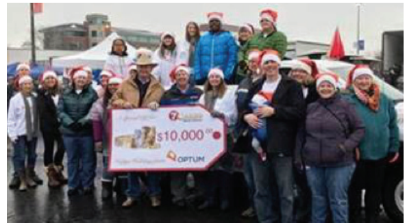
7Cares Idaho Shares day in Boise, Idaho